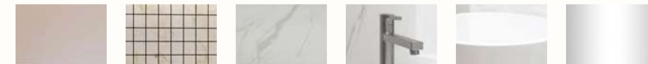
LACQUERED MATT CABINETS STATUARIO LINCOLN MARBLE MOSAIC TILE PIECES STONE FINISH WALLS FLOOR MOUNTED BASIN MIXER (GUN METAL FINISH) FREE-STANDING BASIN FULL-HEIGHT MIRROR WITH SHELF IN MARBLE

* ALL SANITARY FITTINGS FOR MASTER BATH TO BE IN CHAMPAGNE GOLD FINISH